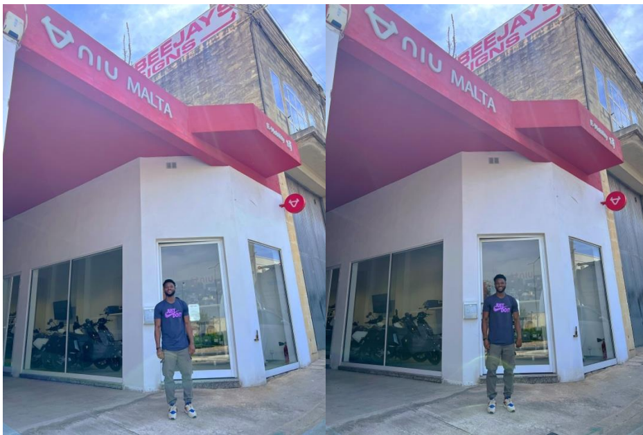
"Posing for a Photo at the NIU Office Alongside My Supervisor"