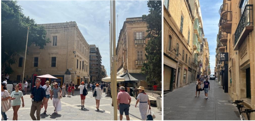
A snapshot captured at the entryway to the ŻEBBUĠ branch of GO ELECTRIC NIU Offices, MALTA